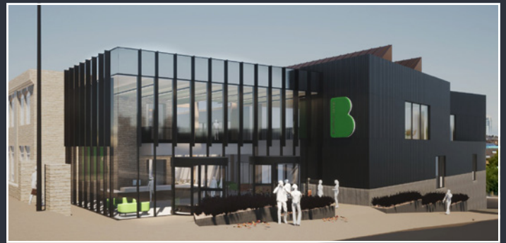
The Technical Excellence College in Construction.

The Knowledge Quarter is designated as an area expected to have the largest potential impact and benefits on Bradford. With targeted investment, Bradford College will enhance its capacity to deliver vocational training and professional development that feeds directly into the local economy.