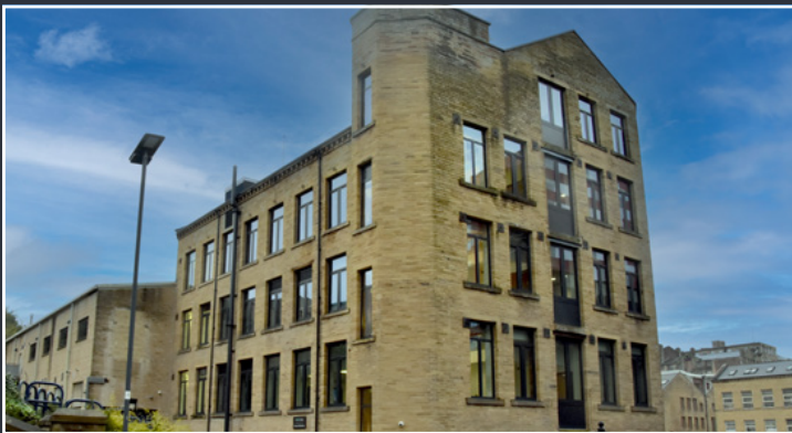
Bradford College's Garden Mills was transformed in 2024 after a £6.9m refurbishment project to create a cutting-edge STEM building for higher-level/degree students.

With a rich legacy of skills-based learning, a deep-rooted commitment to the local community, and a location ripe for redevelopment in the city's Knowledge Quarter, we are uniquely aligned with the City of Bradford Development Framework (2024).