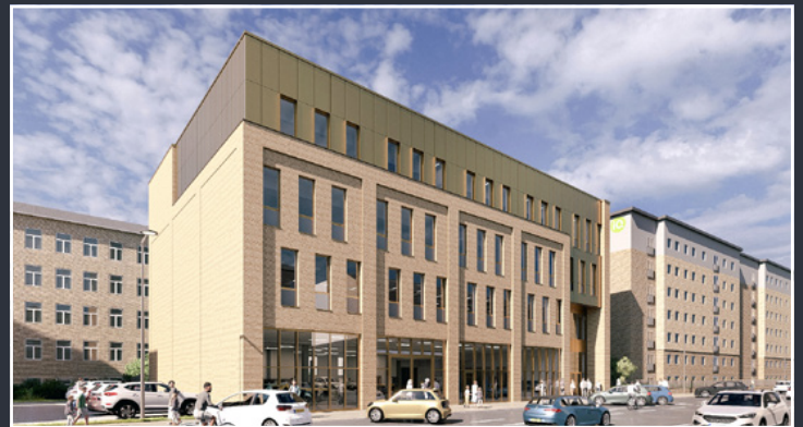
The purpose-built £19m Bradford College Junction Mills will complete in 2026, teaching modern automotive and digital engineering curricula.