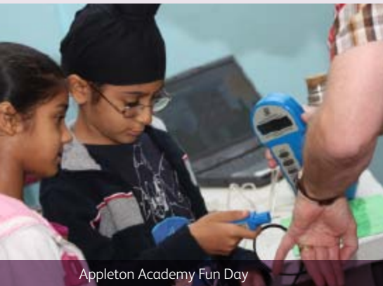
Appleton Academy Fun Day