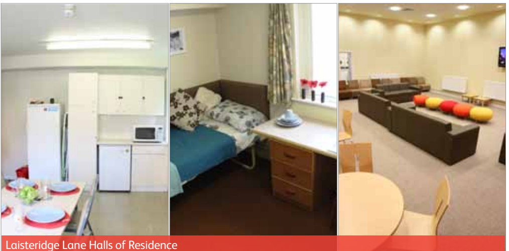
Laisteridge Lane Halls of Residence

✉ accommodationservices@bradfordcollege.ac.uk